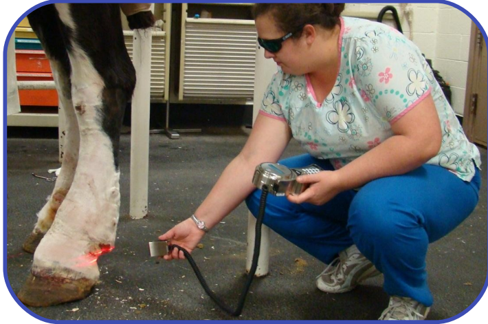
Fig 7. Application of LLLT to the left distal hindlimb wound.