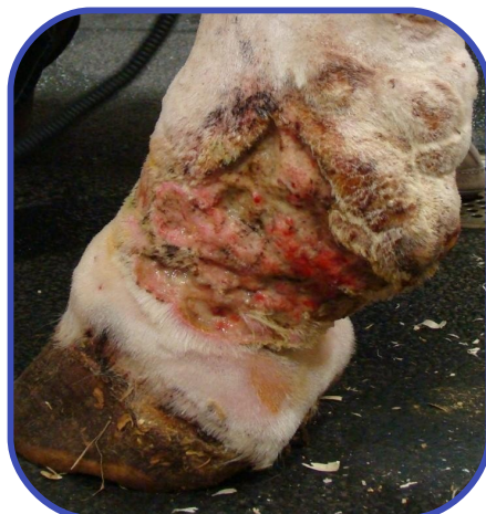
Fig 5. Right hindlimb post-operatively.