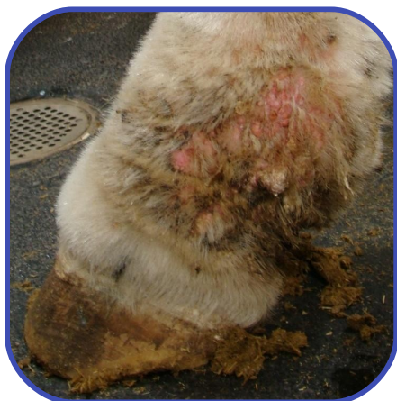
Fig 3. Right hindlimb at presentation.

distally to the coronet (Fig.2 and 3). The exact duration and progression of the condition as well as her previous medical history was unclear at the time of presentation because she had recently been rescued by the owners. Aside from the bilateral distal hindlimb masses, no additional significant findings were noted on physical exam.