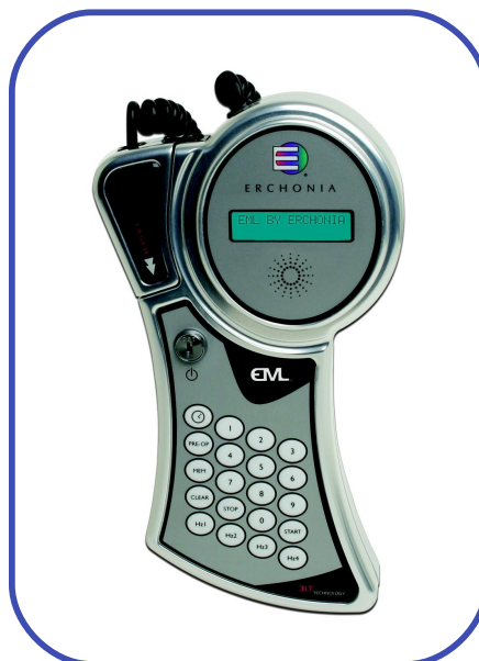
Fig 6. LLLT device used to treat patient.

clinical impression was favorable because the wounds demonstrated excellent contraction and epithelialization without exuberant granulation. Clinical efficacy has not been documented in the literature. 8 Although these results are anecdotal, we feel LLLT has great potential in wound management. The physiologic mechanism of LLLT is stimulation of enzymes in the electron transport chain that increase ATP production. The increase in cellular activity at and around the wound enhances wound healing. The use of LLLT for wound treatment in human medicine is well documented; its use in veterinary medicine has not been extensively documented. In the future, LLLT could become a common modality for treatment of equine wounds.