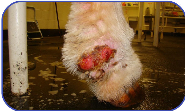
Fig 8. Left hindlimb leg wound on March 9, 2011 (91 days post-op).