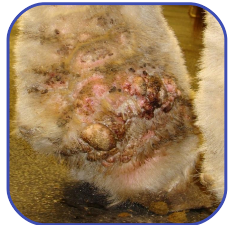
Fig 2. Left hindlimb at presentation.