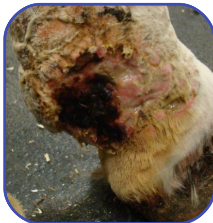
Fig 4. Left hindlimb post-operatively.

performed. The LLLT device was a 7.5 milli Watt dual diode, 635 nm, constant wave 3b medical laser a (Fig. 6). All ANSI laser safety guidelines for use of lasers on health care facilities (Z136.3) were closely observed. LLLT consisted of 5 minutes over the wounds, 3 minutes over the distal limb and 3 minutes over the nerve root (L3) (Fig. 7). Epithelialization and contraction were documented photographically daily (Fig 8 and 9).