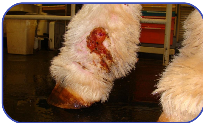
Fig 9. Right hindlimb wound on March 9, 2011 (91 days post-op).